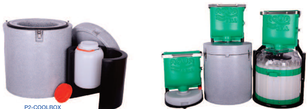
P2-COOLBOX Passive Cooling System

Aquamatic Ltd Soapstone Way, Irlam, Manchester M44 6GP, UK t: +44 (0) 161 777 6607 f: +44 (0) 161 777 6617 sales@aquamaticsamplers.com www.aquamaticsamplers.com