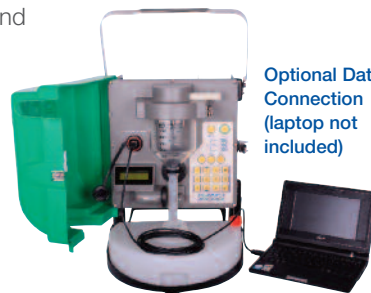
Optional Data Connection (laptop not included)